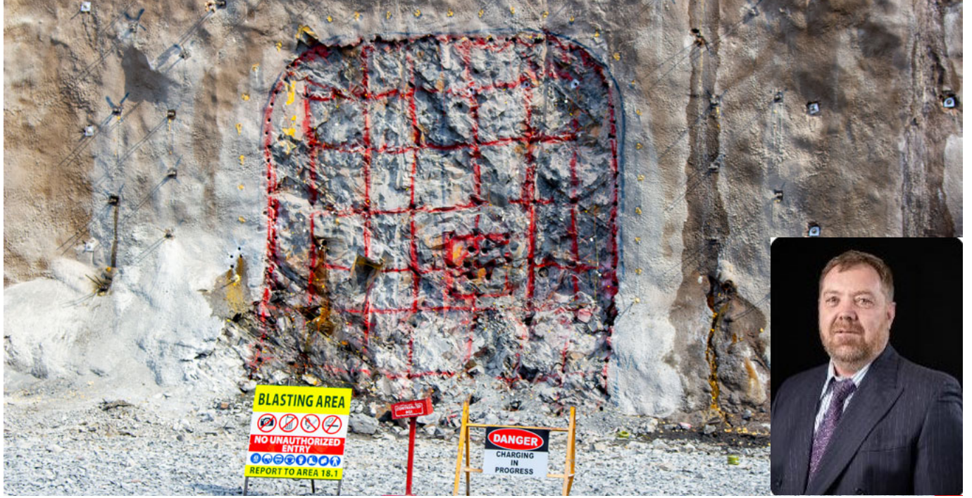
One of the three portals earmarked for blasting

The Jwaneng Underground Project, (JUP) is set to transform Jwaneng Mine into a safe and world class underground operation. This flagship project has continued to draw massive interest locally and afar as it marks the dawn of a new era for the 'King of Mines'. A highlight of this included the recent Debswana Board pronouncement of an impressive BWP13.6 Billion capital investment. This investment entrusted to the Exploration Access Development, (EAD) Phase of the project embodies the shareholders confidence on the business and provided a great morale boost to the team.